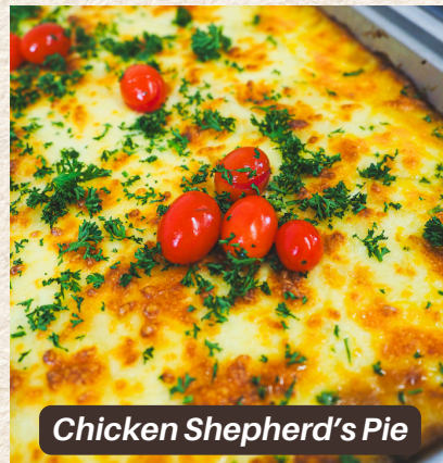
Chicken Shepherd's Pie