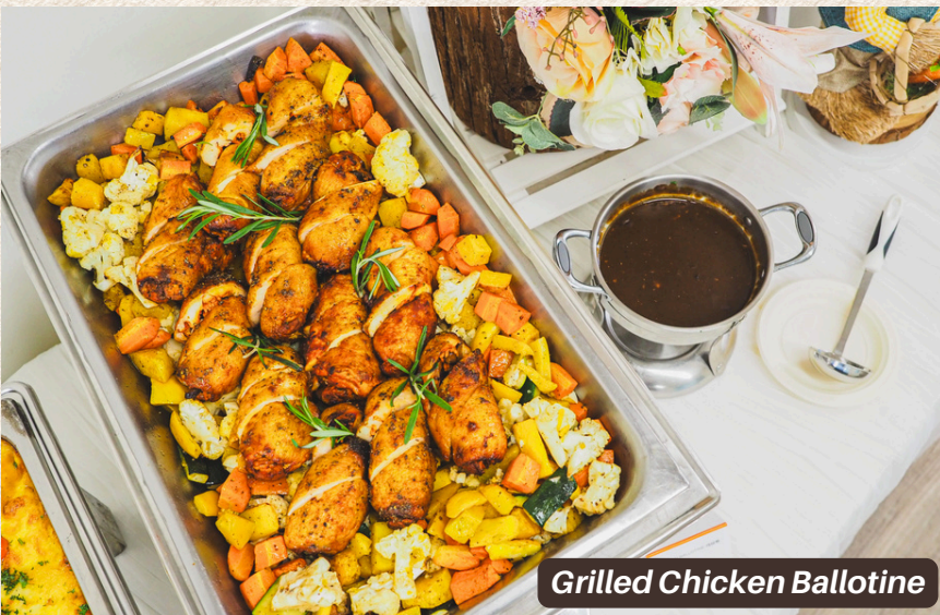
Grilled Chicken Ballotine