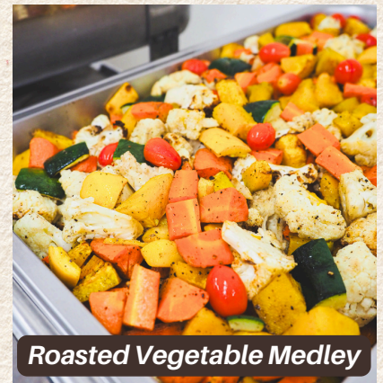
Roasted Vegetable Medley