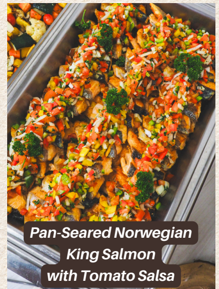
Pan-Seared Norwegian King Salmon with Tomato Salsa